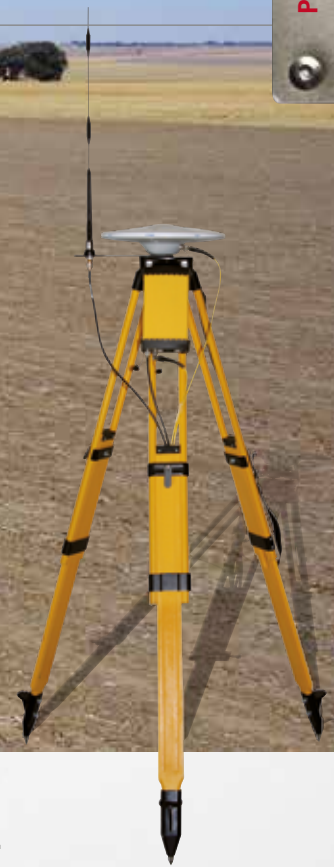
RTK Base Station

The most user friendly display available. The FM750 is the starting point for the ultimate Advanced Farming System. The display can be used for light bar, assisted and integrated guidance systems. With a built in dual frequency GPS and GLONASS receiver you get to choose you accuracy option without adding for an extra GPS receiver to the cab.